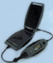
Power Monkey Explorer

*optional plug-in solar panel available at extra cost