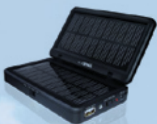
iceTech Solar i9005